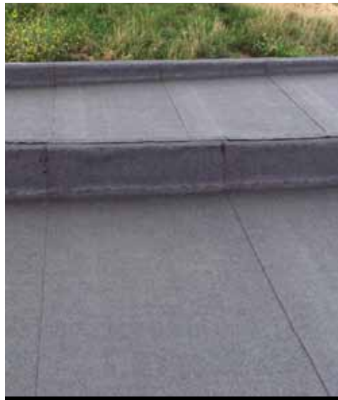
ARDEX WPM 555 Shelterbit Phoenix Star (Mineral) Dark Grey

Redsteel Napier are also fixing the zinc cladding. A combination of Zinc and Hinuera Stone is being used for the exterior cladding.