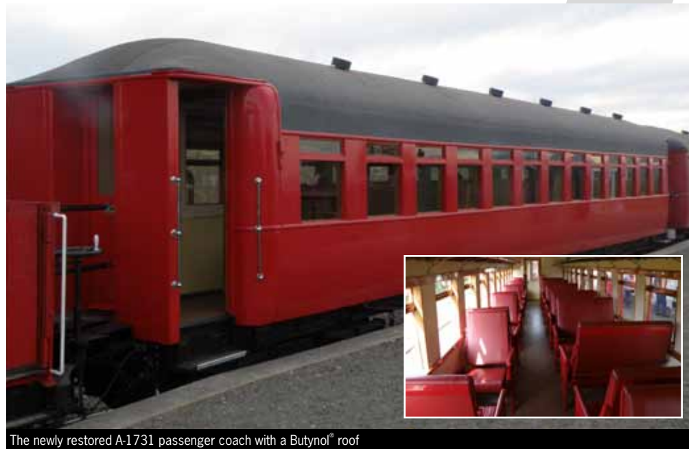
The newly restored A-1731 passenger coach with a Butynol® roof

After a small ceremony the invited guests boarded the new coach for a ride through to Waikari, pulled by a Weka Pass Railway early steam engine.