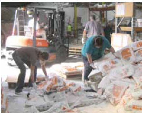
Office staff and factory staff working together to clean the mess in the Finished Goods store after the earthquake.

Once engineers had confirmed that the buildings were safe, ARDEX employees returned to work. Together we tidied up the factory, cleaned up the finished goods store, sorted out the stock in the warehouse and opened our doors for business again.