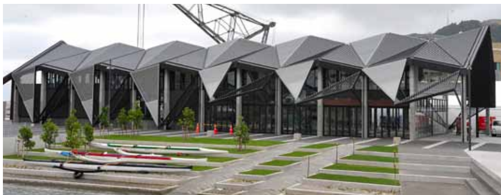
Above & Below right: Wharewaka o Poneke on Wellington's waterfront