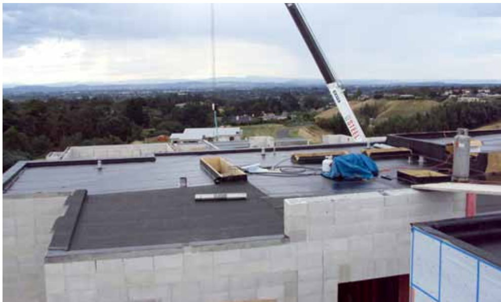
The roof under construction in Havelock North, Hawke's Bay