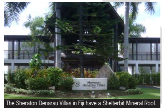
The Sheraton Denarau Villas in Fiji have a Shelterbit Mineral Roof.

ARDEX has a 20 year relationship with local company East West Engineering Ltd and the applicators are very competent in ARDEX total roofing systems. This, combined with the ease of supply from ARDEX New Zealand, ensures that ARDEX products are regularly specified for projects in the Pacific Islands. ARDEX Shelterbit Mineral Torch Applied Membrane was also used to re-roof The Sheraton Denarau Villas in Nadi, Fiji.