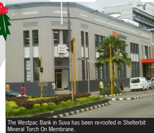
The Westpac Bank in Suva has been re-roofed in Shelterbit Mineral Torch On Membrane.