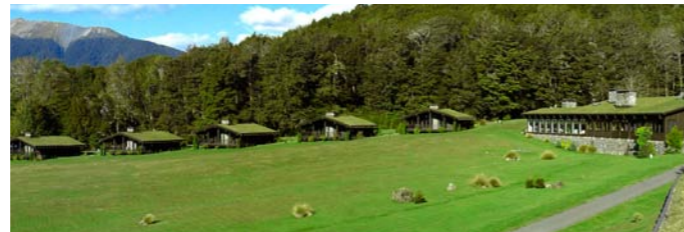
The chalets at Takaro Lodge, Te Anau are an early example of living roofs using ARDEX Butynol as a waterproofing membrane. Completed in 1970.

Non-Carcinogenic Compared to bitumen – what's green about a roof with carcinogens?