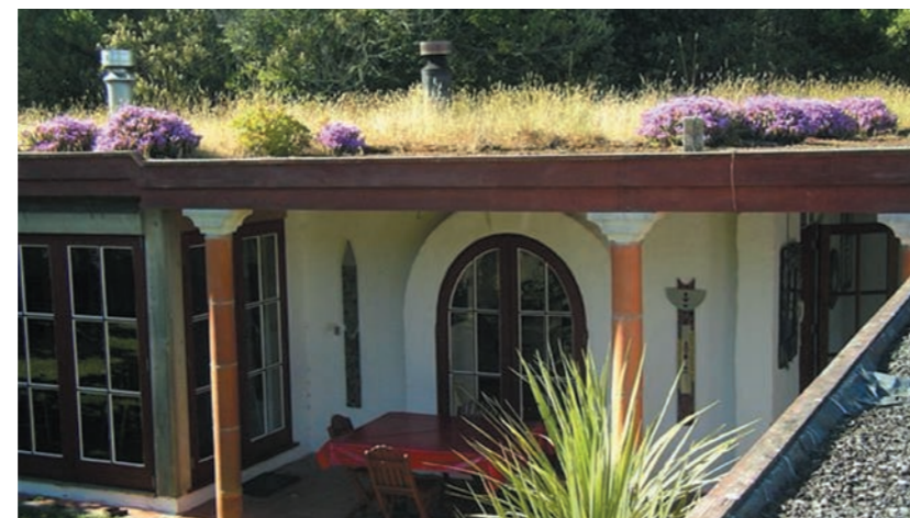
Above (and front cover): Takaro Lodge, Te Anau

ARDEX works in conjunction with New Zealand's leading supplier of extruded insulation boards (XPS or PIR) to supply a full and complete warrantable system for warm and living roofs. Contact an ARDEX technical representative for a complete specification for your project.