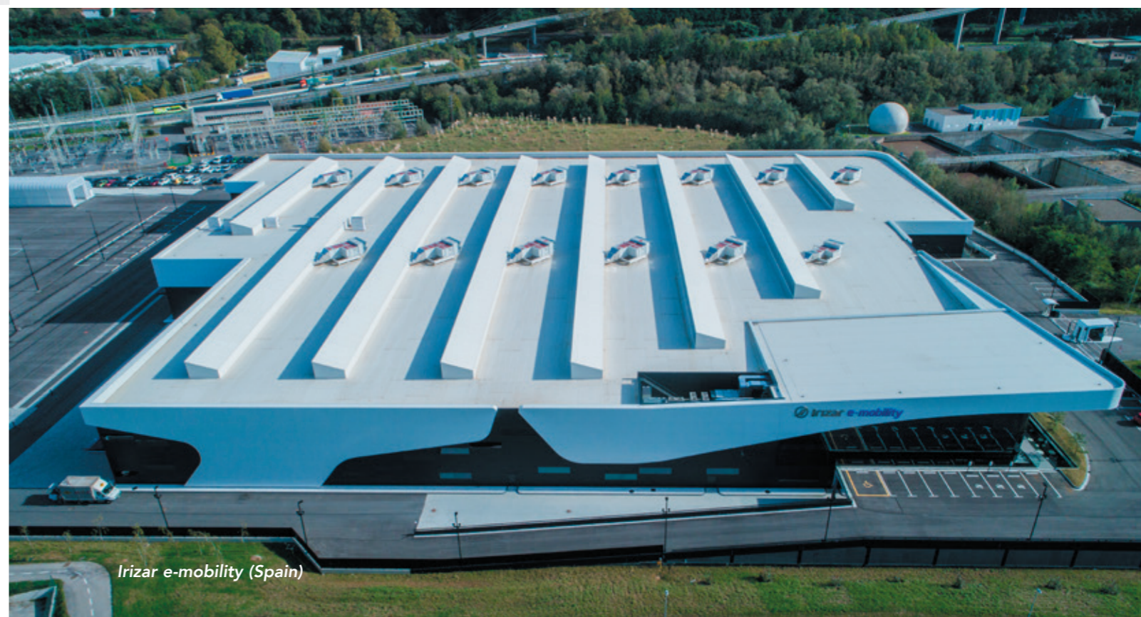
Irizar e-mobility (Spain)